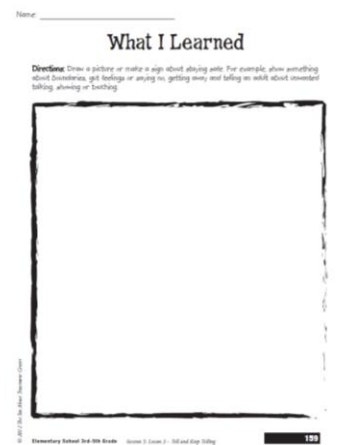
What I Learned (pg. 159)