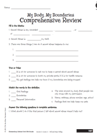
My Body, My Boundaries Comprehensive Review – Older Version (pg. 167-168)