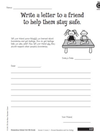
Write a letter to a friend to help them stay safe – Older Version (pg. 117)