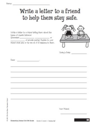
Write a letter to a friend to help them stay safe (pg. 95)