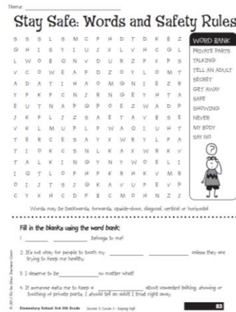
Stay Safe: Words and Safety Rules (pg. 83)