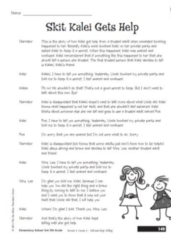
Skit: Kalei Gets Help – Older Version (pg. 149)

*Please note, it's highly recommended for the curriculum facilitator to play the role of Turtle/Keo/Kalei.