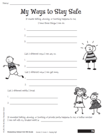
My Ways to Stay Safe (pg. 79)