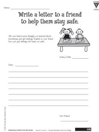
Write a letter to a friend to help them stay safe – Younger Version (pg. 115)