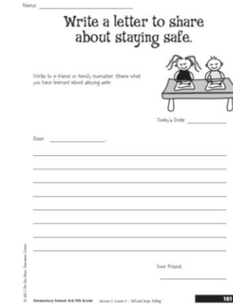
Write a letter to share about